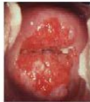
Normal with ectropion