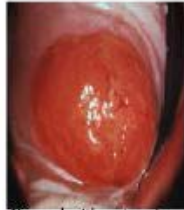
Normal with extensive ectropion