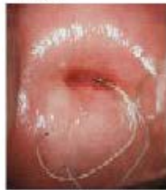
Normal with IUCD